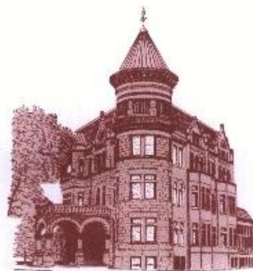
The Heurich House Museum is the former home of the Historical Society of Washington and served as AOI's headquarters from 1956 until 2003.